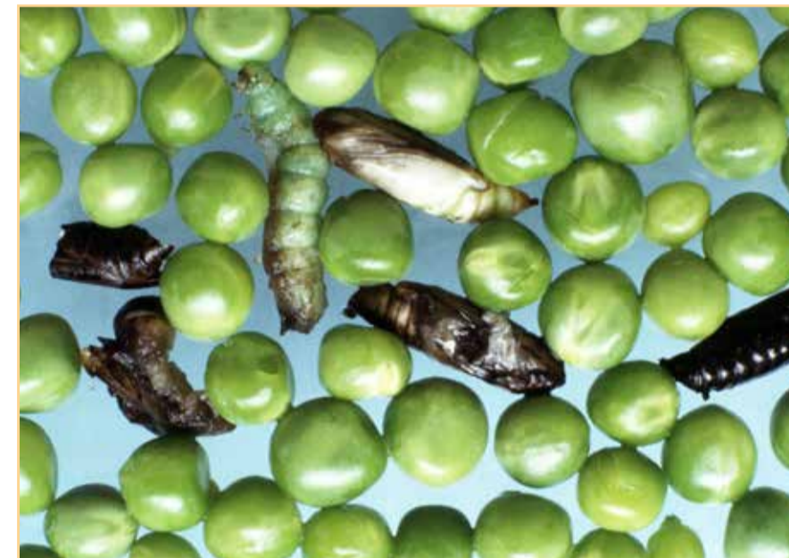
Silver Y moth pupae