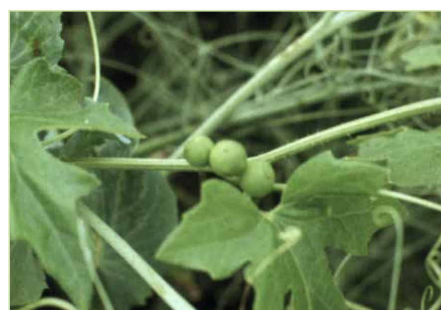
White bryony berries