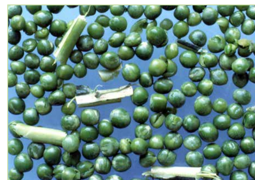
Oilseed rape debris