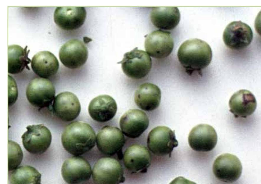
Black nightshade berries