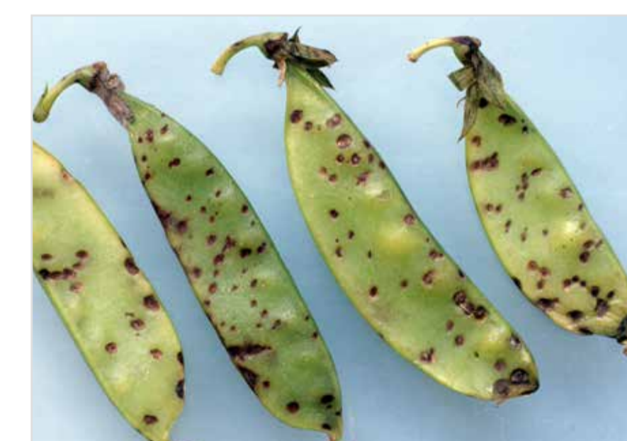
Mycosphaerella pod spot