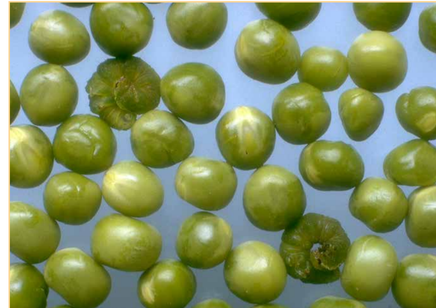
Silver Y moth caterpillars