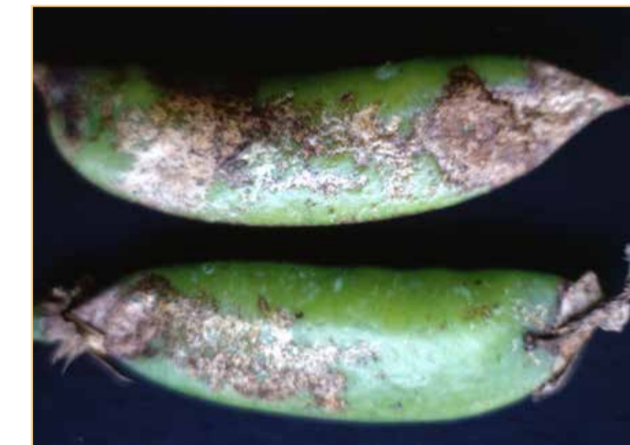
Pea thrips damage