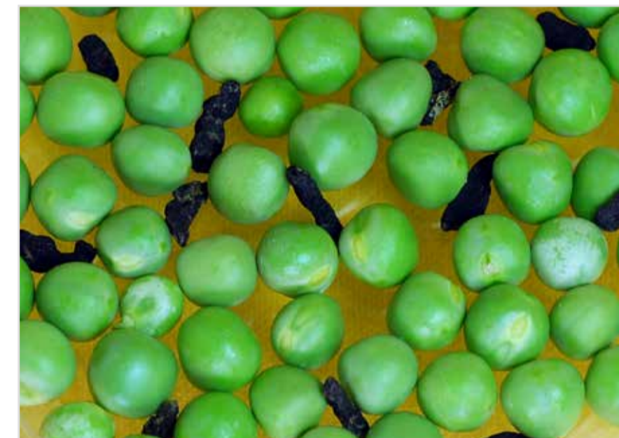
Sclerotia of Sclerotinia