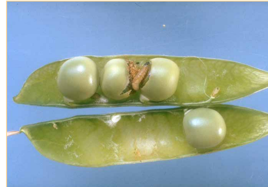
Pea moth caterpillar