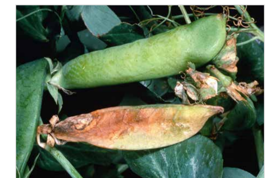
Botrytis pod rot