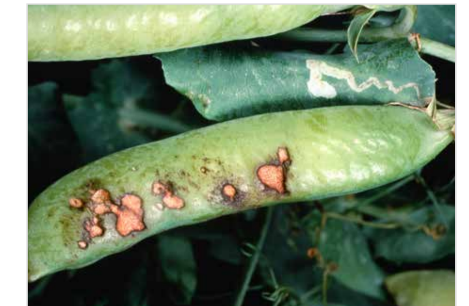
Ascochyta pod spot