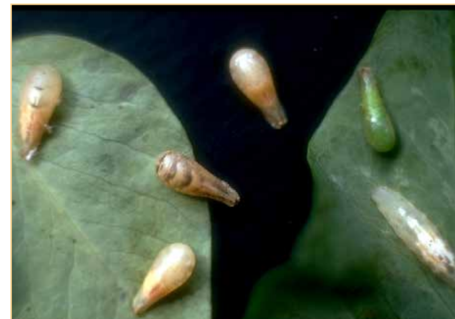
Hoverfly larva and pupae