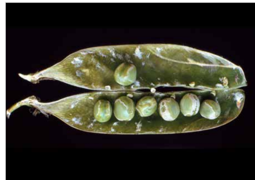
Pea seed-borne mosaic virus