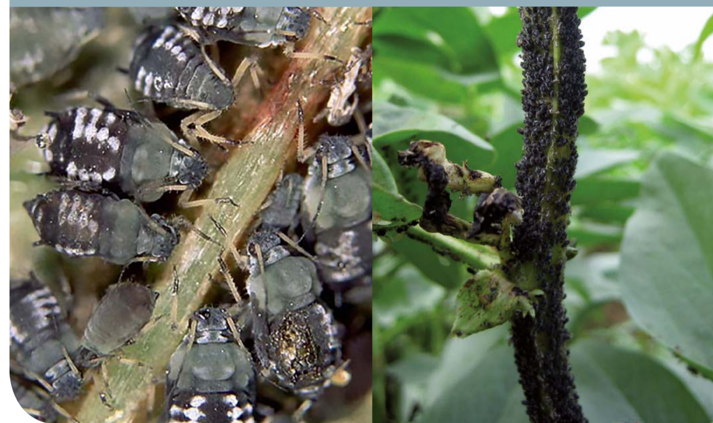
Black bean aphid GRB/BB Aphis fabae