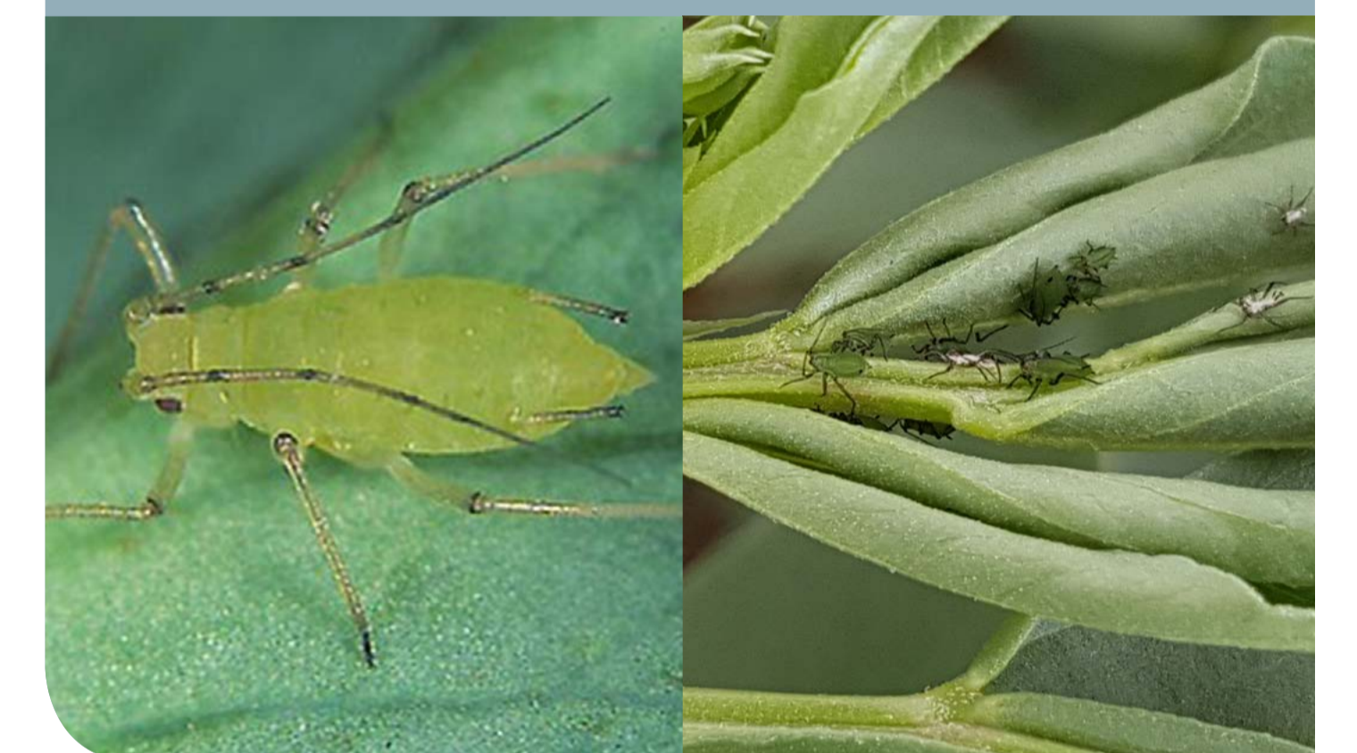
Pea aphid/Vetch aphid BB Acyrtosiphon pisum, Megoura viciae