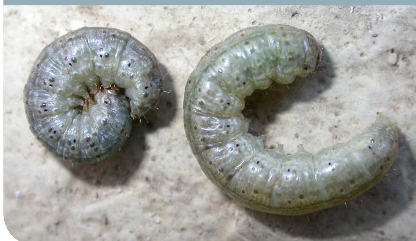
Cutworm GRB Agrotis spp.