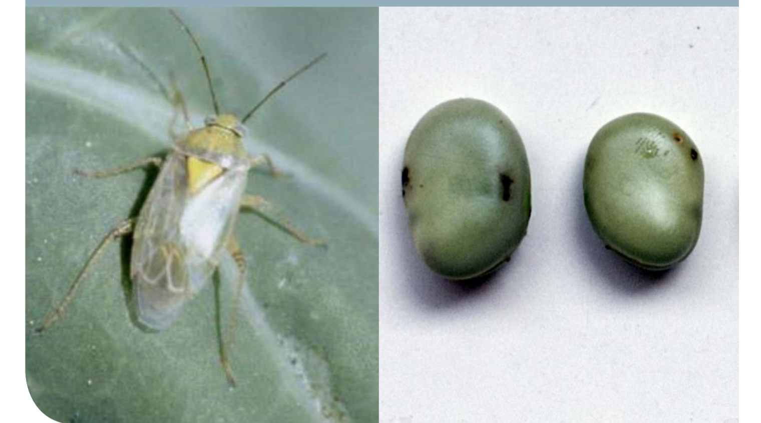
Capsid BB Lygus spp. and others