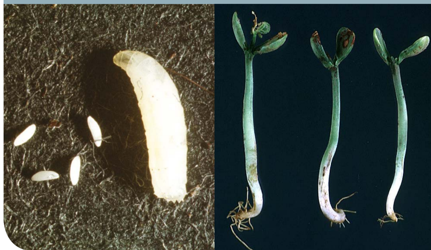
Bean seed fly GRB Delia platura, Delia florilega