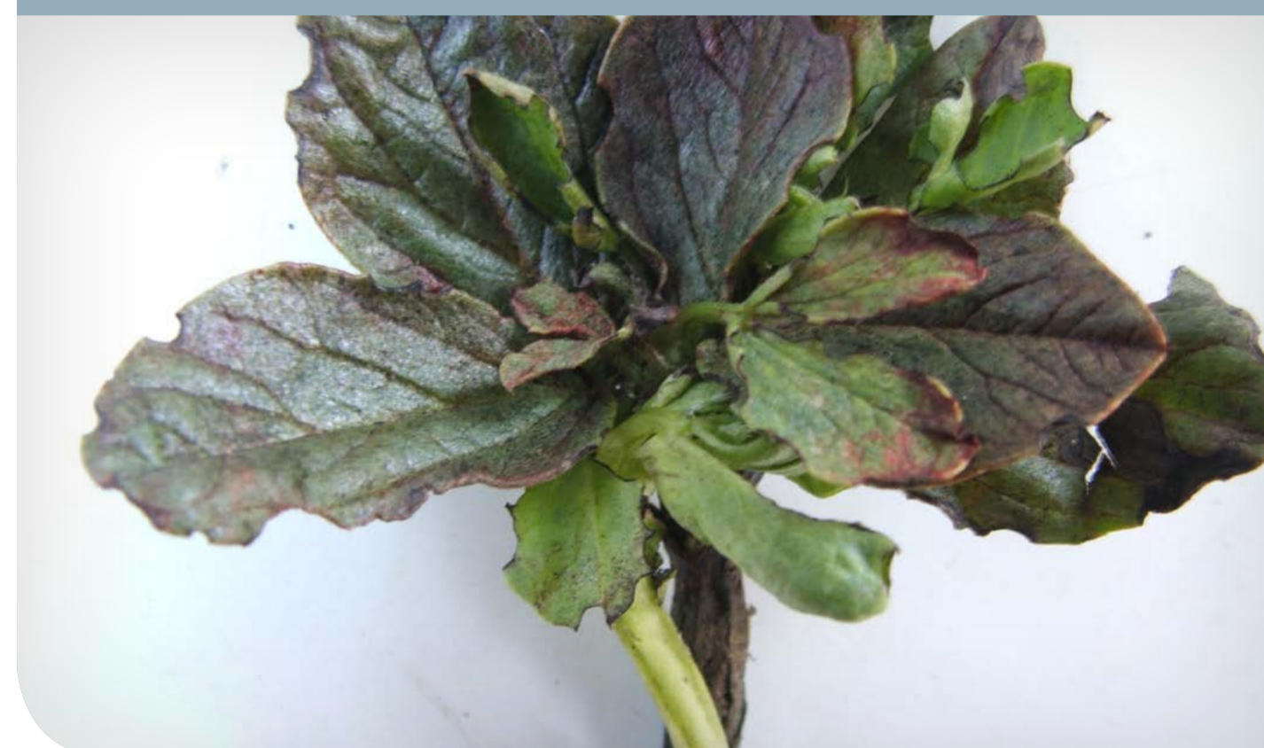
Field thrips BB Thrips angusticeps