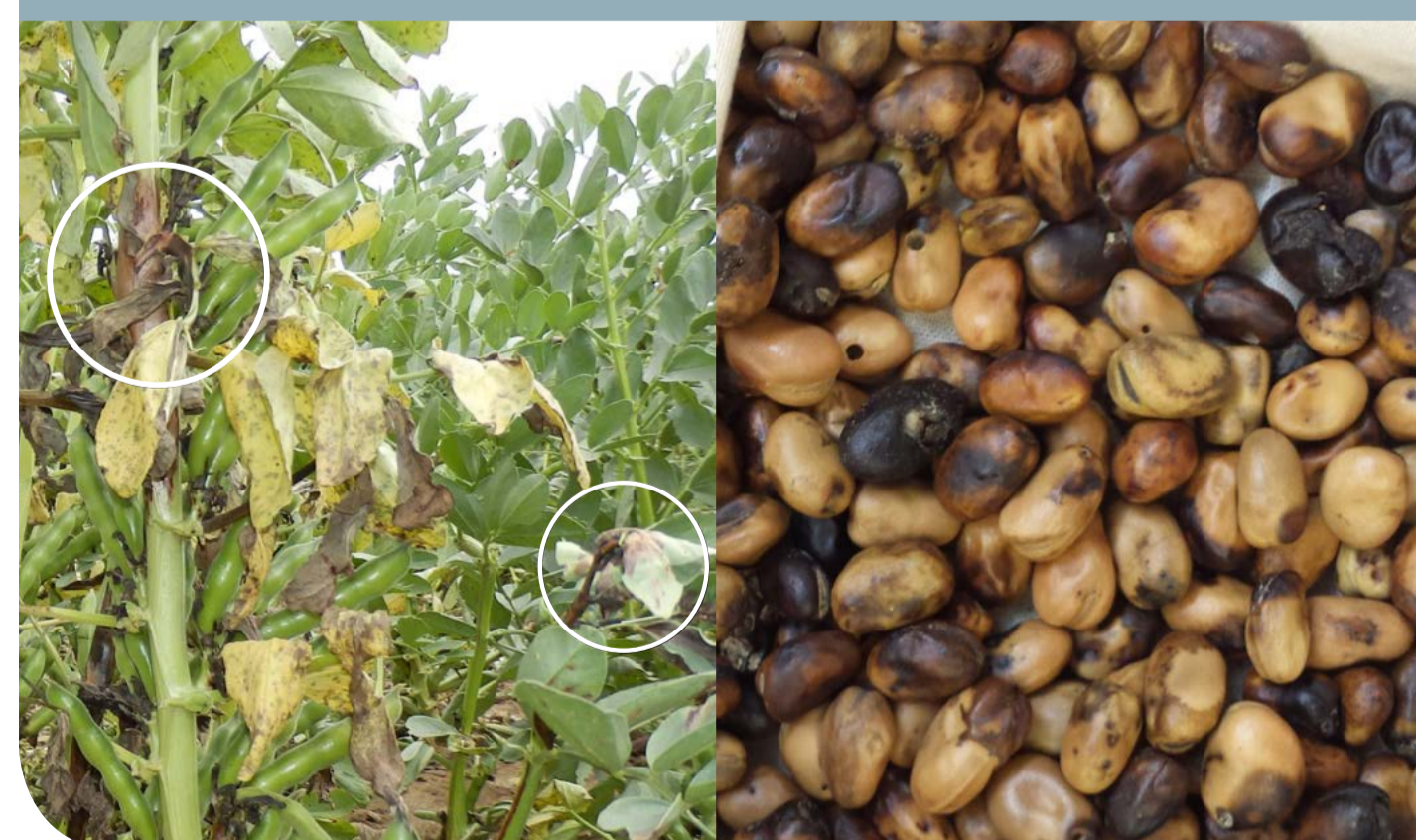
Stem nematode BB Ditylenchus spp.