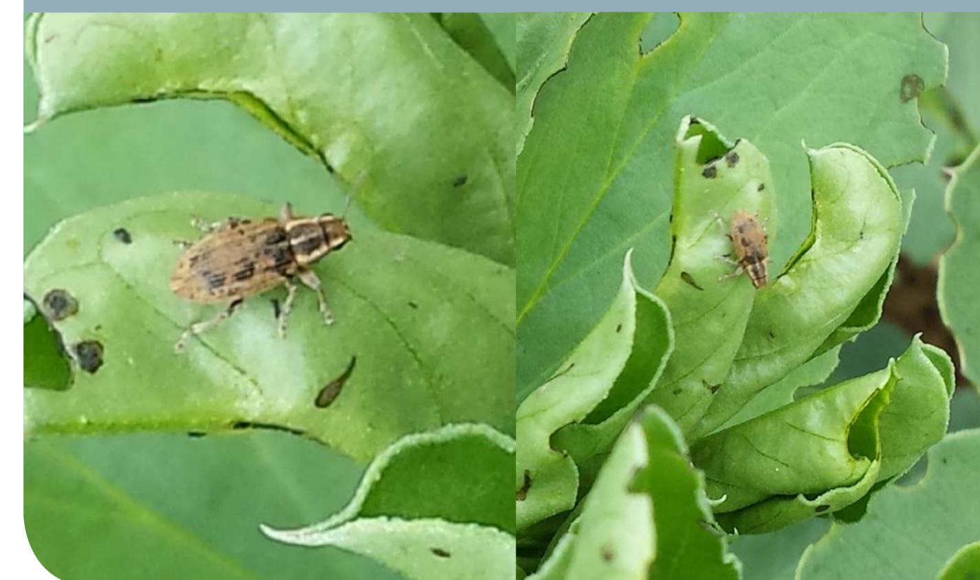
Pea and bean weevil BB Sitona lineatus