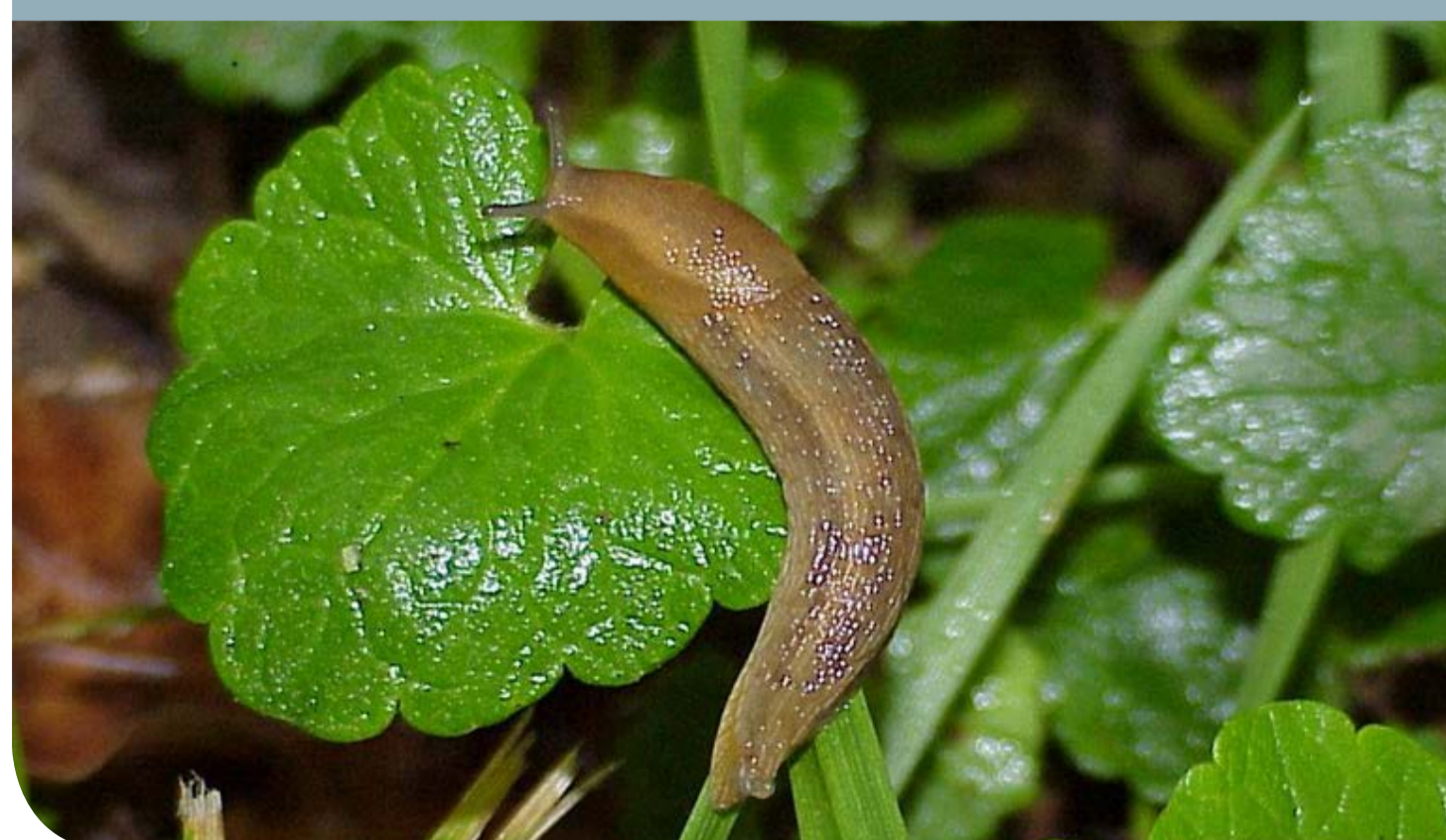
Slugs GRB/BB Derocerus spp., Arion spp. and others