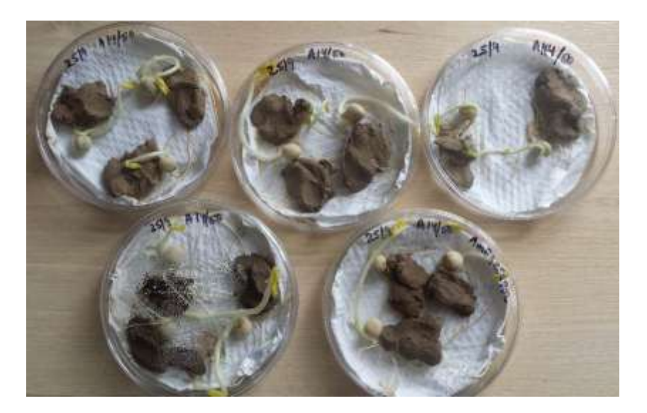
Figure 4. Pea plants in the Dish and Towel method with soil samples placed on top of the plants.

This method was quick to set up and used very little space (Fig 4). Soil samples were used rather than organic matter. The plants had root discoloration but it was not clear from looking at the roots if this was A. euteiches or other fungi especially as this discolouration was also found on the plants under the sterile soil. The main root from each plant was divided into three sections and studied for the presence of oospores. Oospores were not identified in the plants grown in the sterile soil. Twenty nine of the 35 plants with the test soil had oospores in the roots (Table 5).