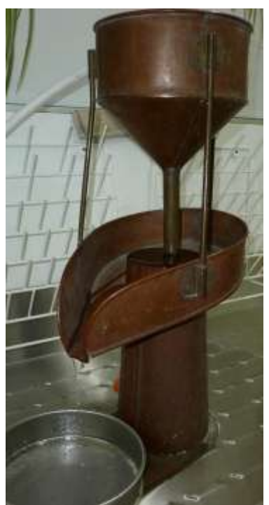
Figure 2 The Modified Fenwick Can used to separate out the organic matter content of the soil.