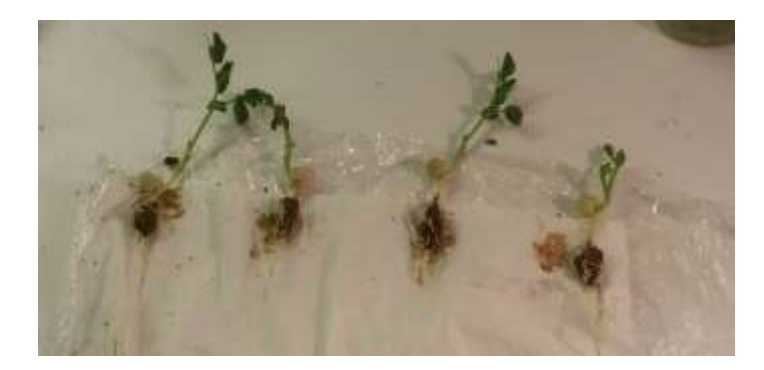
Figure 3 Pea plants unrolled at the end of the Modified Rolled Towel method. The plants were looking healthy with some root discolouration.

In the first experiment all the plants died as the towelling was too wet and the plants were smothered in the towelling. The second experiment resulted in some very healthy plants (Fig 3). Some plants had a general discolouration. To ascertain if this was the result of A. euteiches infection root segments were studied under the microscope for the presence of oospores (Table 4).