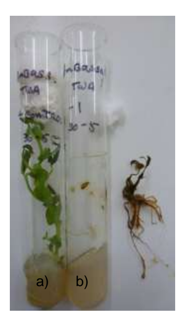
Figure 5. Peas grown in boiling tubes in the presence of the test soil. Tube a) has been inoculated with sterile soil, tube b) with the test soil.

The tubes were assessed 20 days post inoculation using the 1-5 scale used for the soil baiting technique. It was observed that the plants were either clean or black so the data was presented as number infected plants with a maximum of five plants assessed (Table 6). A. euteiches was confirmed by the presence of oospores.