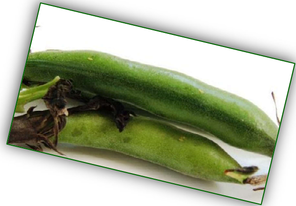
Figure 4 – Eggs on pods

Certain products can be used in field and broad beans during flowering and have been shown in historic trials to reduce the level of damage. This includes lambda-cyhalothrin. In broad beans several products containing lambda-cyhalothrin are available under Extension of Authorisation for Minor Uses. More recently, insecticides have been less effective, and it is thought that this may be due to insecticide resistance. To improve control, work in LINK (DEFRA)* and Innovate UK** research projects indicated that more reliable control of the pest was achieved by combining spray timing with temperature thresholds.