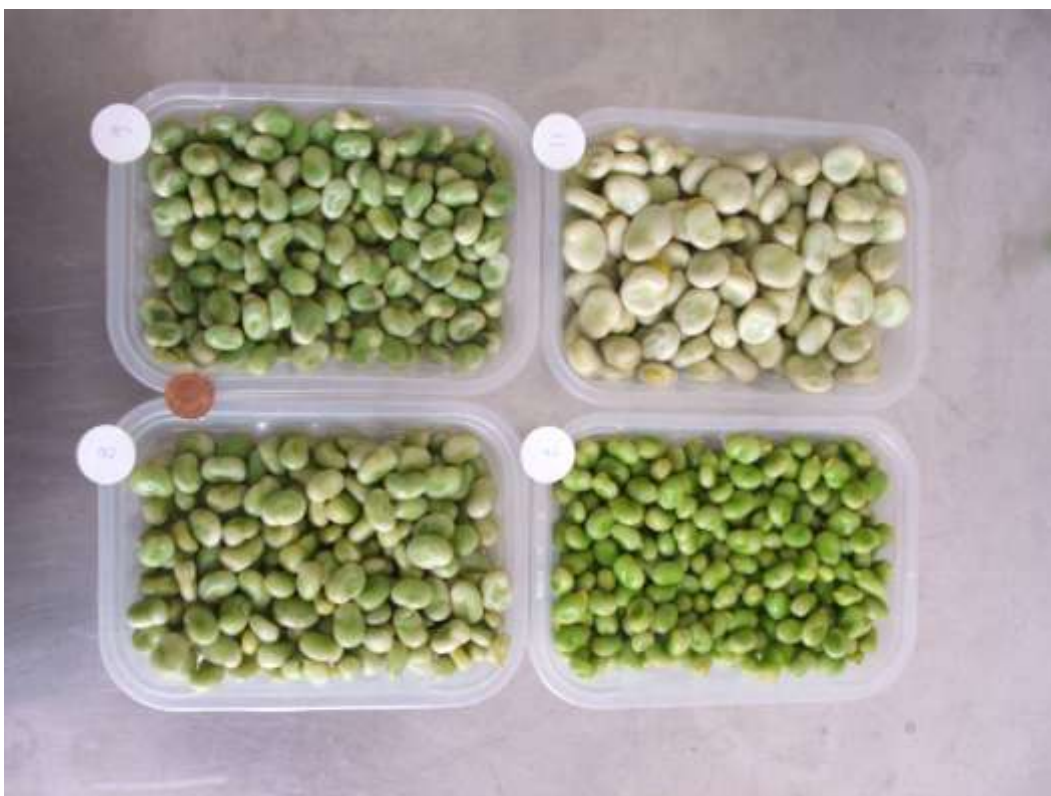
Figure 2. Colour variation after processing and defrosting: top left white/green (Finale), Bottom left (Listra), top right white/grey (Witkiem Manita), bottom right bright green (Greeny) -2011.