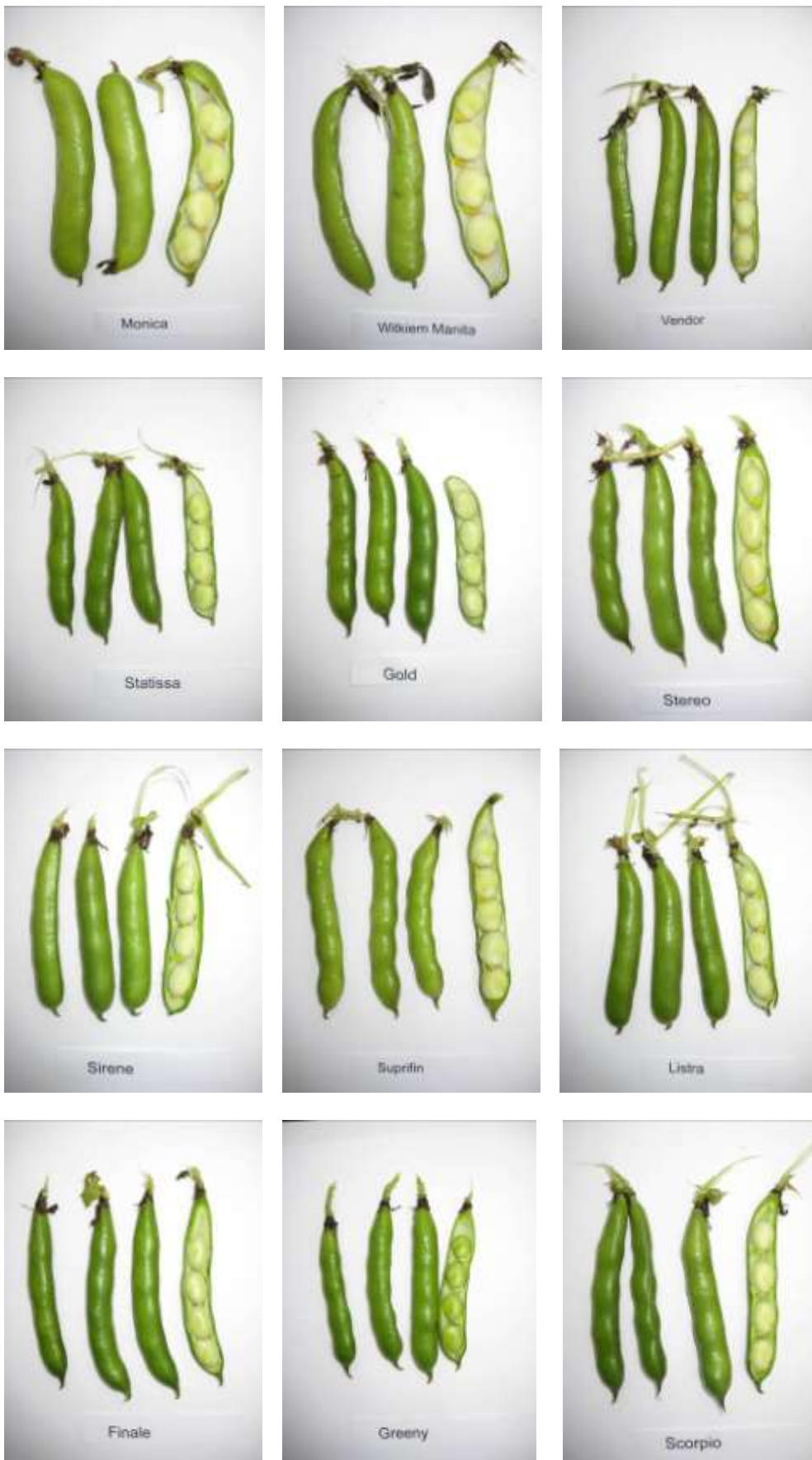
Figure 3. Whole pods, beans per pod, snag attachment and raw bean colour - 2011.