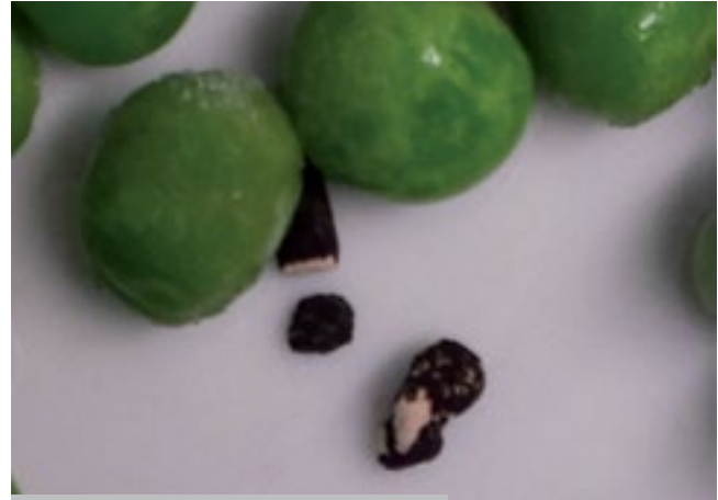
Figure 6. Sclerotia contamination in vining peas