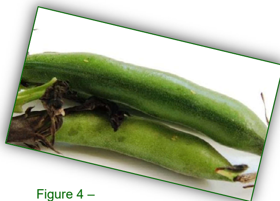
Figure 4 – Eggs on pods

A spray should be applied when adults are found in the crop and 50% of the bean plants have developed the first pods on the lowest trusses, but only after the recorded maximum daily temperature has reached at least 20°C on two consecutive days. A second spray should be applied 7-10 days later. Research has shown that if the spray is applied through angled nozzles or twin caps angled both ways using a medium spray quality, control is significantly improved. Insecticides should be applied in the early morning or late evening to avoid direct contact with bees.